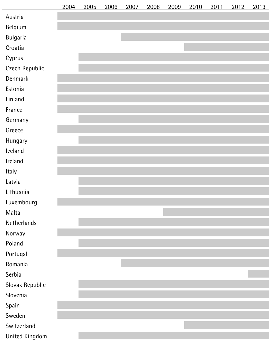
Figure 1: Countries included in the EU-SILC User Database